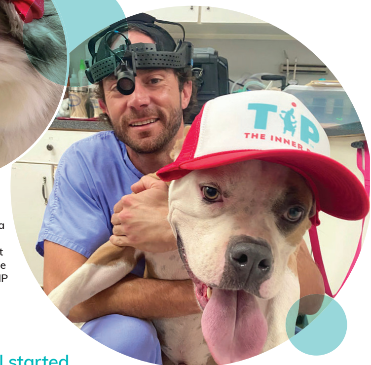
Cookie and Mishka receiving their heartworm test at their local vet office thanks to grants TIP has secured.

At Covetrus, one of our core values is to “do good”, and we love supporting the good work our customers are doing every day. One of those customers is The Inner Pup (TIP) located in New Orleans.